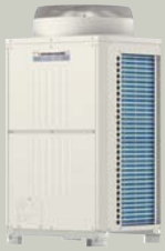
PURY × 9